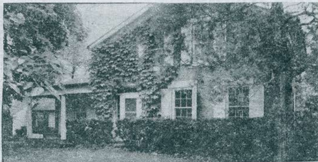
The Wallace House